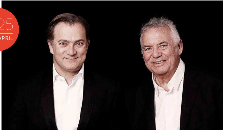
Renaud Capuçon - Dominique Bluzet